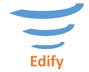
Your way to enriching possibilities